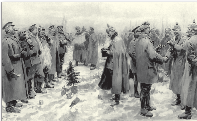
Image of the 1914 Christmas Truce

There is an immediacy this year to call for cessation of the war that has been ravaging Ukraine and Russia for the past 11 months. It draws the atten-