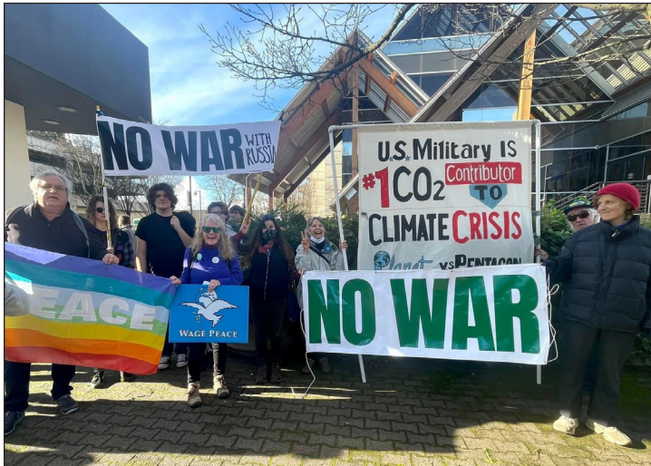
Martin Luther King Jr. Day in Eugene, Oregon.